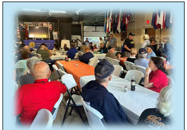
A little socializing before dinner.