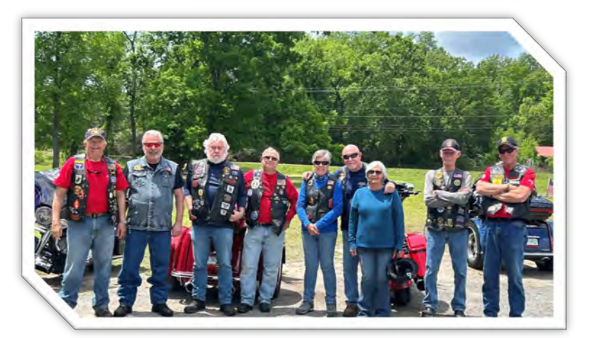
Chapter 193 Members completed the 2024 ALRSC Legacy Ride over the weekend. Raising money to support the Veterans and Children Foundation. Well Done