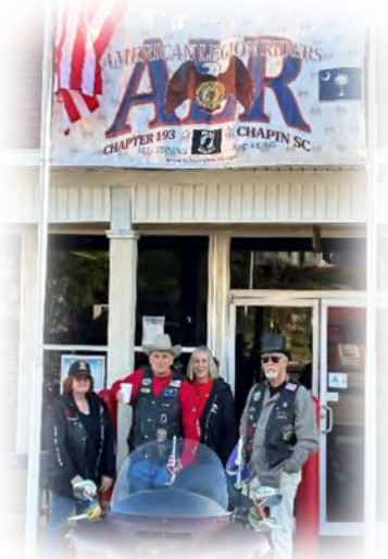
Another great Breakfast at Zorba's